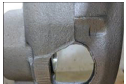
With Metal Guard 560